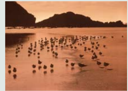
Sandon sunrise, Yuraygir National Park

The longest stretch of undeveloped coastline in NSW, Yuraygir offers striking cliffs, rocky headlands, isolated beaches and quiet lake systems set against a backdrop of forests, heaths and wetlands. Boardwalks, walking tracks, picnic spots and several camping areas are scattered throughout the park. Phone Grafton 6641 1500 9D/E