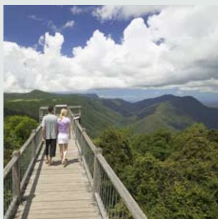
Skywalk boardwalk at Dorrigo National Park

Dorrigo Rainforest Centre introduces visitors to the lush and beautiful subtropical rainforest of this World Heritage area. Venture onto Skywalk for a spectacular bird's eye view over the rainforest canopy or walk among the vines, ferns and soaring trunks to sparkling waterfalls. The Visitor Centre is open 9:00am to 4:30pm every day and includes an information desk, National Parks Shop, a display on rainforest and the Canopy Cafe. Phone Dorrigo 6657 2309 7H