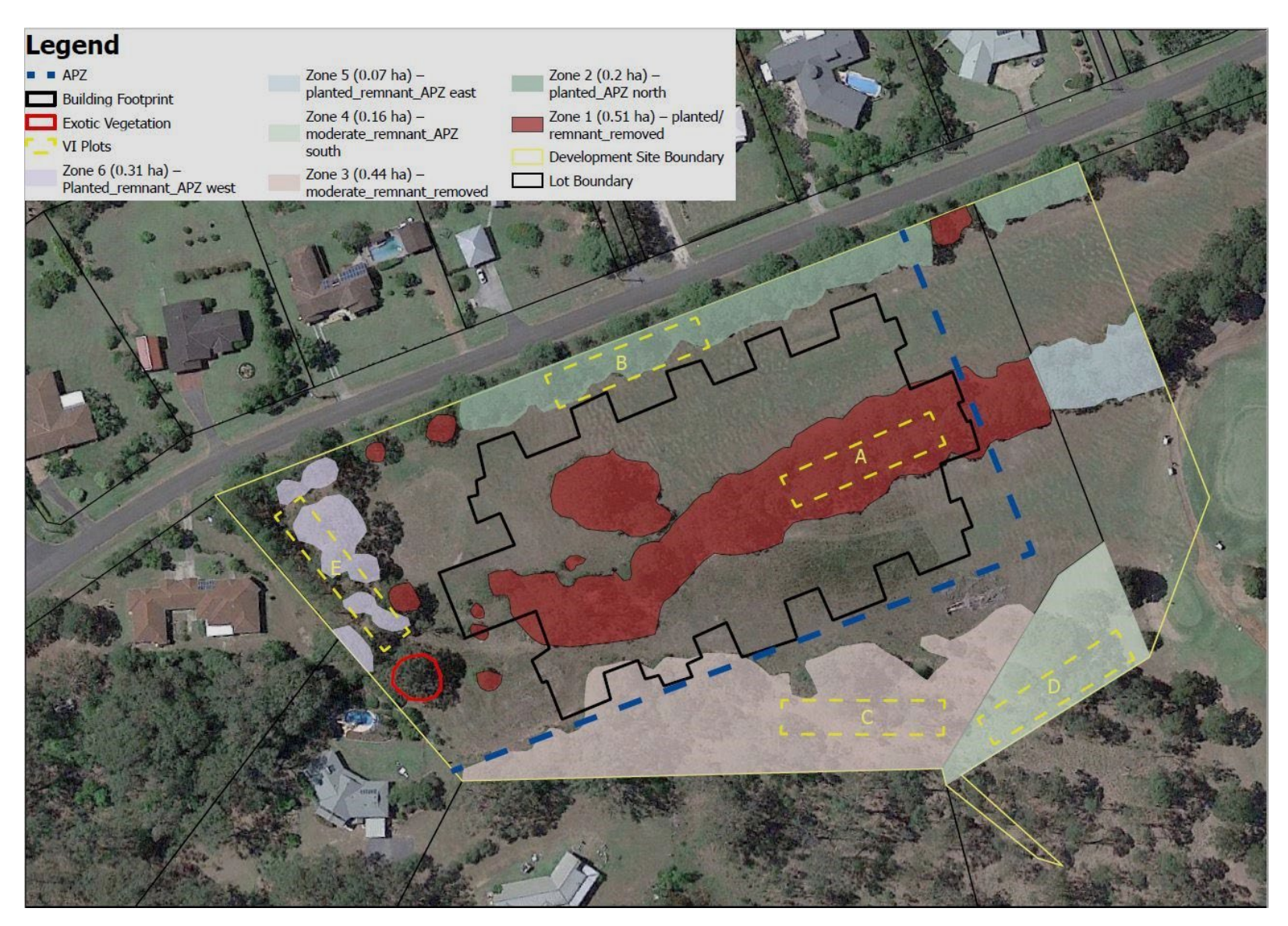
Figure 1 Aged care facility vegetation zones