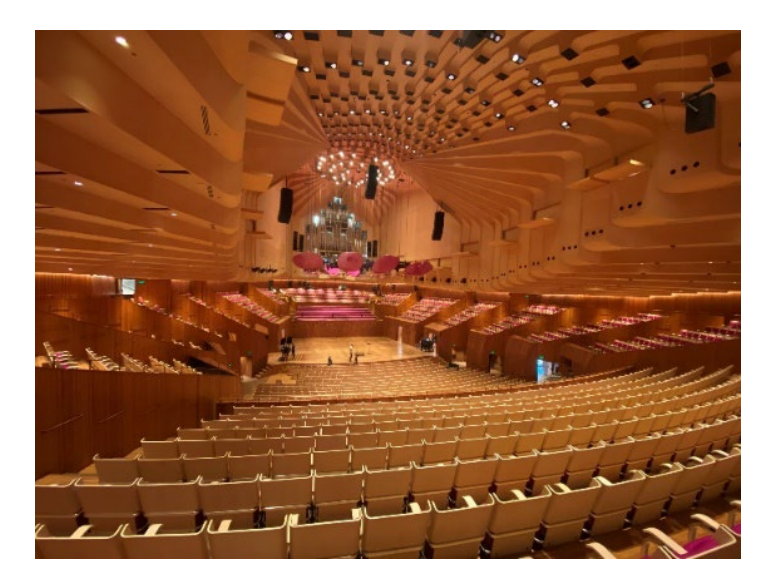
Sydney Opera House Concert Theatre interior