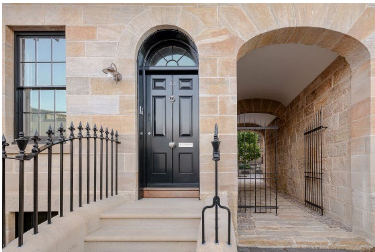
Millers Point Townhouse entry (Photo credits: Design 5 Architects, design5.com.au)