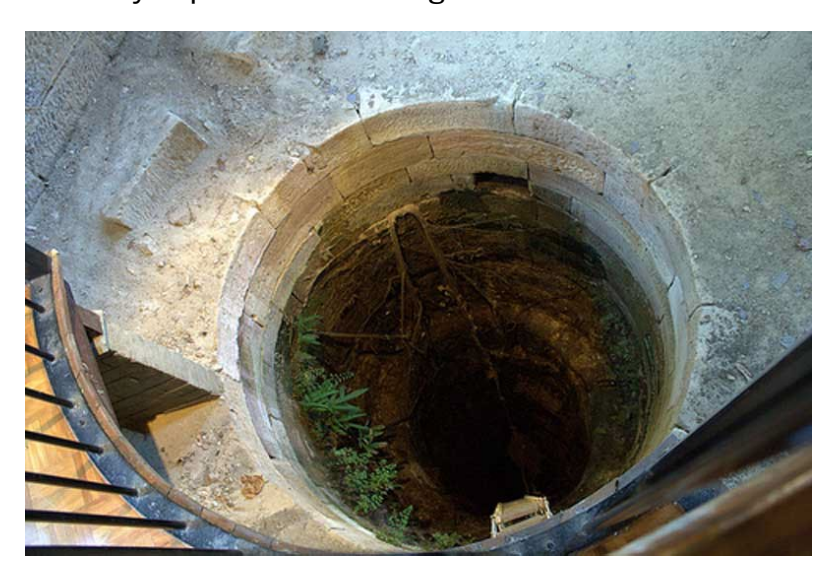
Busbys Bore view from hotel

service the growing colony. The Bore was accidentally damaged during foundational excavation for a hotel in east Sydney. Heritage NSW worked closely with the developer, City of Sydney and Sydney Water to develop a remediation plan. Swift and decisive action on this matter ensured the preservation of Busby's Bore, a critical part of the wider subterranean heritage item, the Tank Stream. The remediation plan included amended archaeology and S60 permits to mitigate impact, and heritage interpretation offsets. Heritage NSW's role in protecting historical infrastructure is key to preserving our story to pass on to future generations.