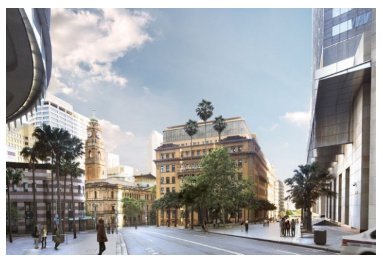
Department of Lands (left) and Education (centre)

The Heritage Council and Heritage NSW have provided invaluable expert knowledge to underpin the conservation and renovation of the Sandstone Precinct, a project partially completed in early 2023. This project is an outstanding example of adaptive reuse which has involved several years of meticulous planning, conservation and renovation. The Education Building has been transformed into a hotel called Capella Sydney, allowing for a "heightened cultural immersion" (brj.com.sg) for visitors to Sydney's historical Sandstone Precinct. The project is predicted to be one of the largest privately funded tourism infrastructure projects in NSW and Heritage NSW continues working with stakeholders to get the best heritage outcomes for the iconic precinct.