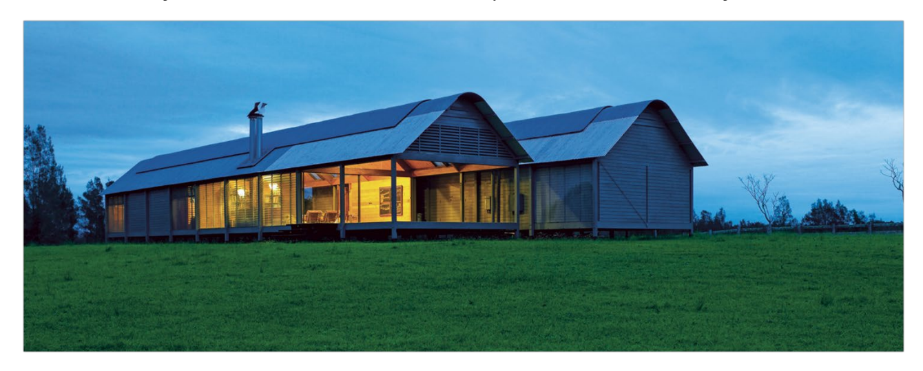
Figure 2: Marie Short Farmhouse.

Marie Short Farmhouse is an early example of an ecologically responsive and socially responsible modernist building that responds to features of the landscape, the materials at hand and local building techniques of the region. Key design features include the roof glazing and adjustable roof louvre system that allow adjustment of airflow and light according with the seasons. It reflects the development of environmentally sensitive architecture in the last quarter of the 20<sup>th</sup> century.