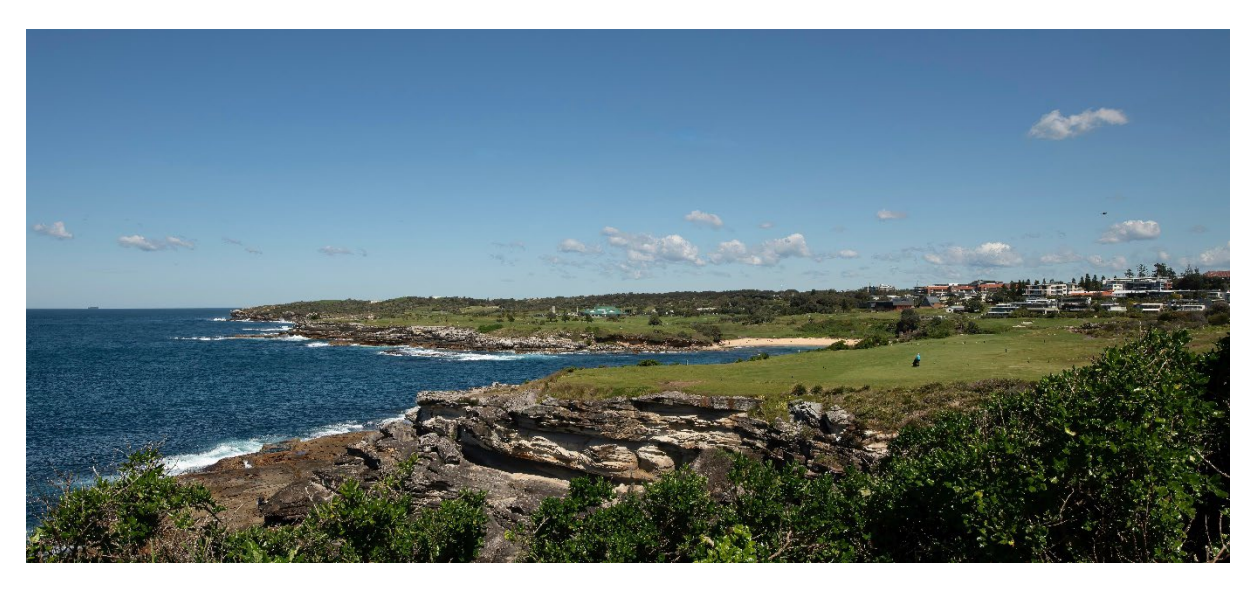
Figure 1: Little Bay Miocene Geological and Oche Site.

It is also significant for its long association with Sydney's Aboriginal people, who've visited and gathered red and white ochre here for over 20,000 years and continue to do so, today.