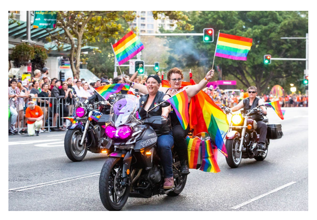
Figure 3: Sydney Mardi Gras Parade – dykes on bikes.