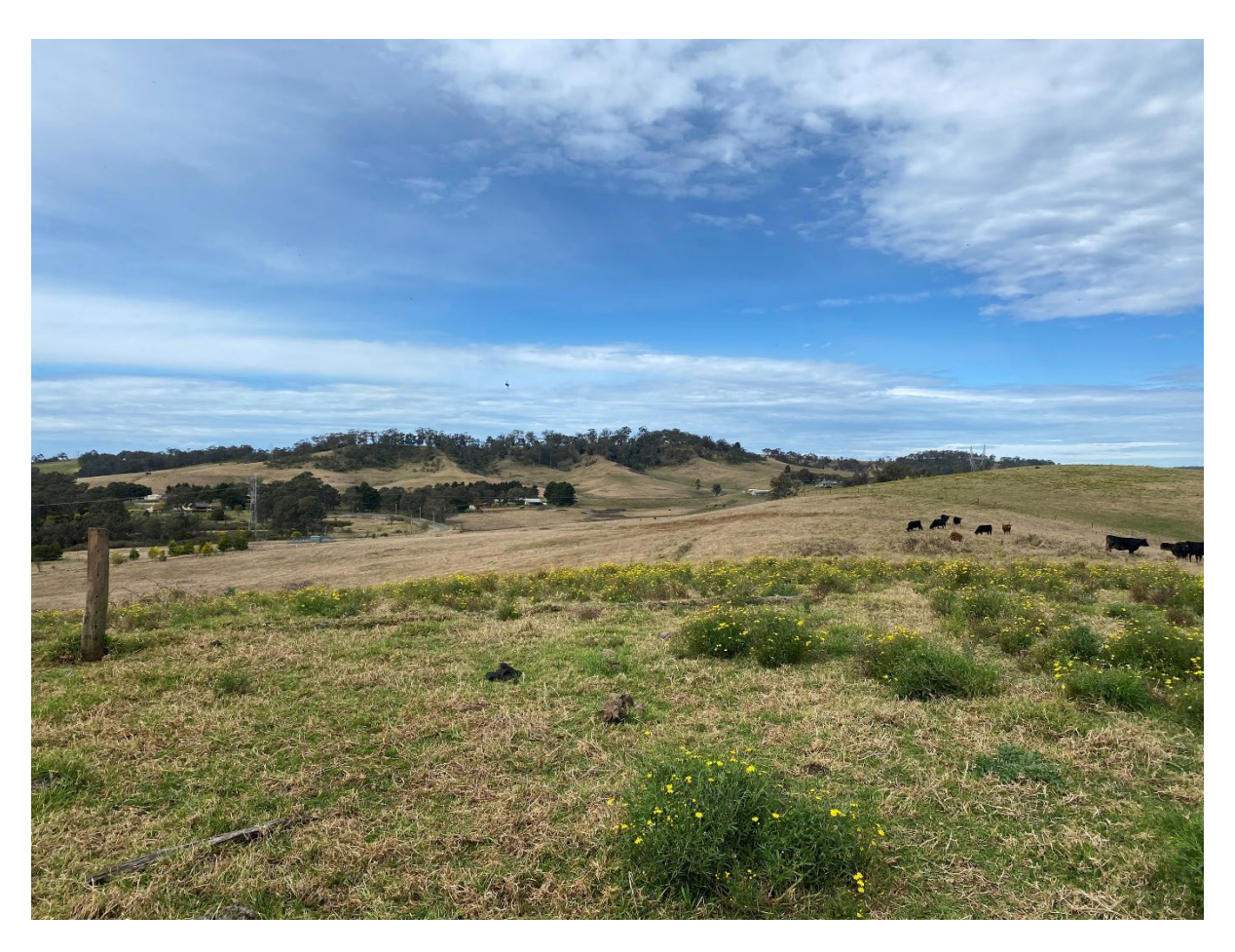
Figure 4:Appin Massacre Cultural Landscape, Area 3, view from Lachlan Vale.