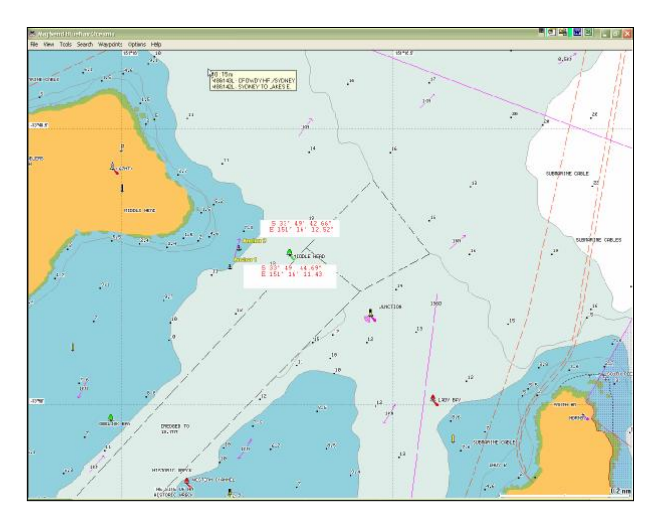
Figure 1 - Location Map.