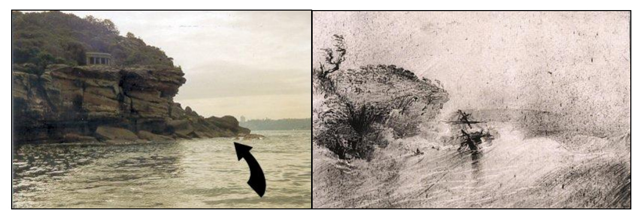
Figure 6: Juxtaposition of Middle Head in 2006 with 1834 drawing of the shipwreck event. (Pencil sketch, Sir Oswald Walters (Undated), Mitchell Library. Sydney)

The most probable position for the wreck event was readily established by comparing contemporary paintings of the tragedy to the modern coastal features. Several isolated table rocks lying out from Middle Head on its south eastern side, closely resembled those portrayed in contemporary paintings of the disaster and indicated that the observed features had changed very little.