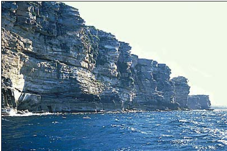
Figure 1: The South Head cliffs where the Dunbar struck in 1857. The wreck site lies in the water at left.