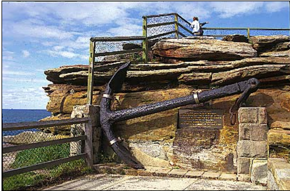
Figure 2: An Admiralty anchor recovered from the wreck site in 1910 and later displayed at The Gap as a permanent memorial to those lost in the tragedy.