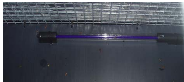
UV black lights available from electronics outlets

When the lights are on they attract insects, the insects in turn attract the toads. The toads push on the one way finger gates to enter the trap to feed on the insects and become captured. During their stay in the trap they feed at their own will at night and seek shelter and water from the trough during the day.