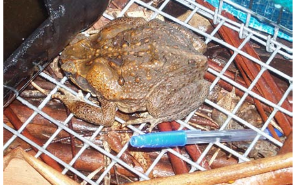
Cane toad caught in a super trap at Mebbin NP during a trial.

Toad carcasses can be disposed of by burial in a garden; ensuring that the depth is sufficient so native and domestic animals don't dig up the carcasses. Alternatively they can be placed in a lidded compost or garbage bin.