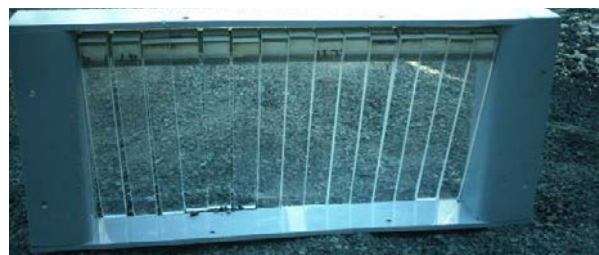
Door showing finger gates manufactured by Frogwatch, Northern Territory