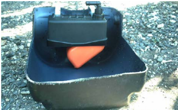
Trough and float valve supply water to captured toads