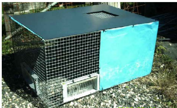
An example of a Super trap

When set up with adequate water and all parts functioning correctly, the Super Trap can house captured toads humanely for an extended period of time.