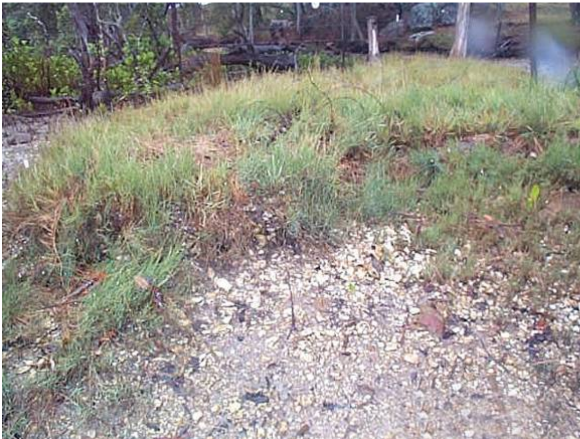
Shell midden.

Middens are amongst the most fragile cultural sites. They can be exposed by wind or degraded by human and animal activity. Effective management of midden sites may include stabilising the surface, such as by encouraging vegetation cover, or by restricting access to the site by erecting fencing.